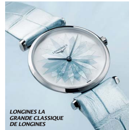
LONGINES LA GRANDE CLASSIQUE DE LONGINES