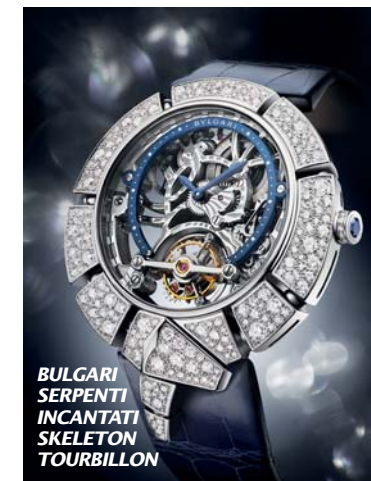
BULGARI SERPENTI INCANTATI SKELETON TOURBILLON