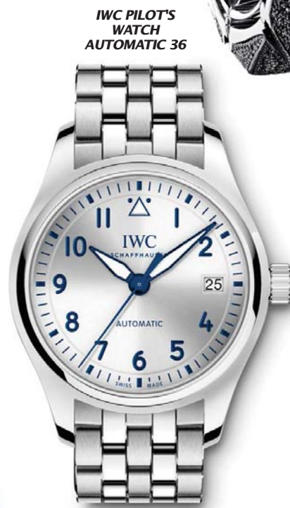
IWC PILOT'S WATCH AUTOMATIC 36