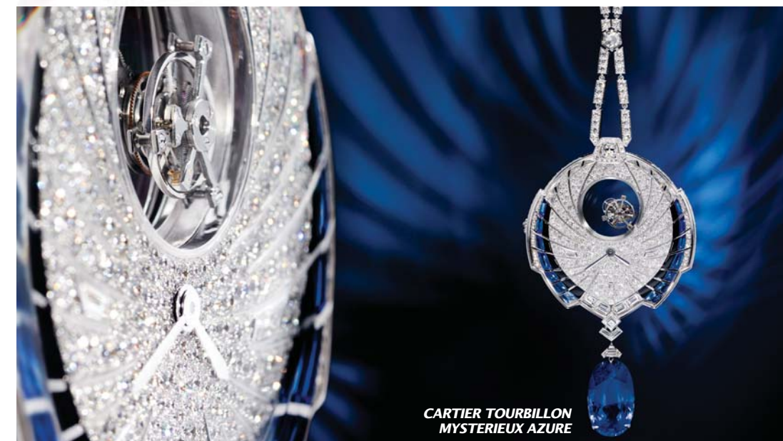
CARTIER TOURBILLON MYSTERIEUX AZURE