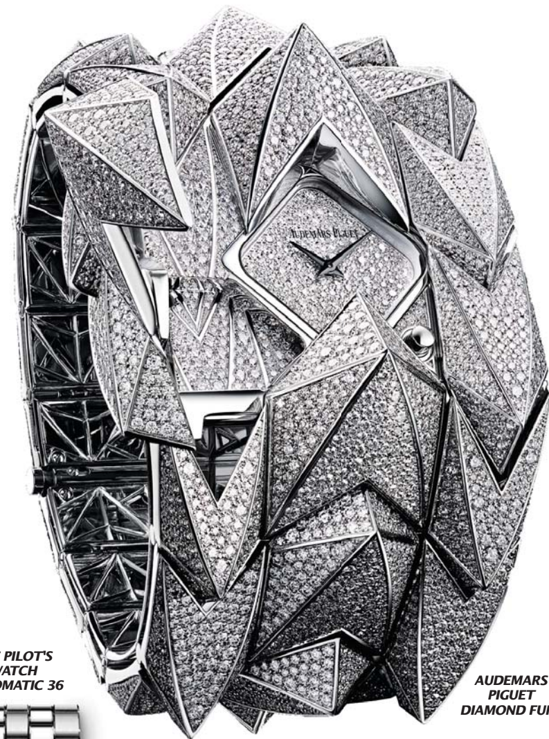
AUDEMARS PIGUET DIAMOND FURY