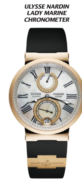
ULYSSE NARDIN LADY MARINE CHRONOMETER