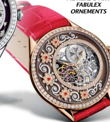
VACHERON CONSTANTIN'S METIERS D'ART FABULEX ORNEMENTS