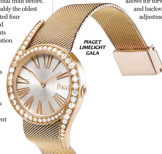
PIAGET LIMELIGHT GALA

allows for forward and backward adjustments. ■