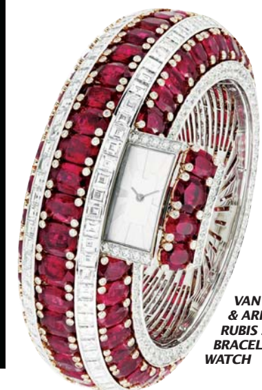
VAN CLEEF & ARPELS RUBIS SECRET BRACELET WATCH

unveiled this year is Van Cleef & Arpels' Rubis Secret Bracelet Watch, which is set with 115 high-quality Mozambique rubies weighing a total of 151.25 carats. This bracelet timepiece is a work of unparalleled precision and intricacy as well as constant technical inventiveness. It has taken more than a year to finish. Fitted with a quartz movement, the watch is hidden in a white gold plate on the inside of the bracelet.