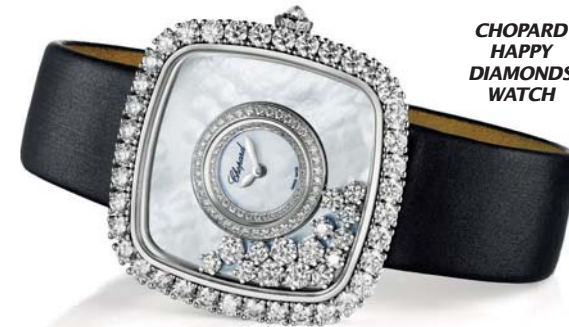
CHOPARD HAPPY DIAMONDS WATCH