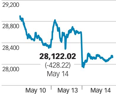
Hang Seng Index